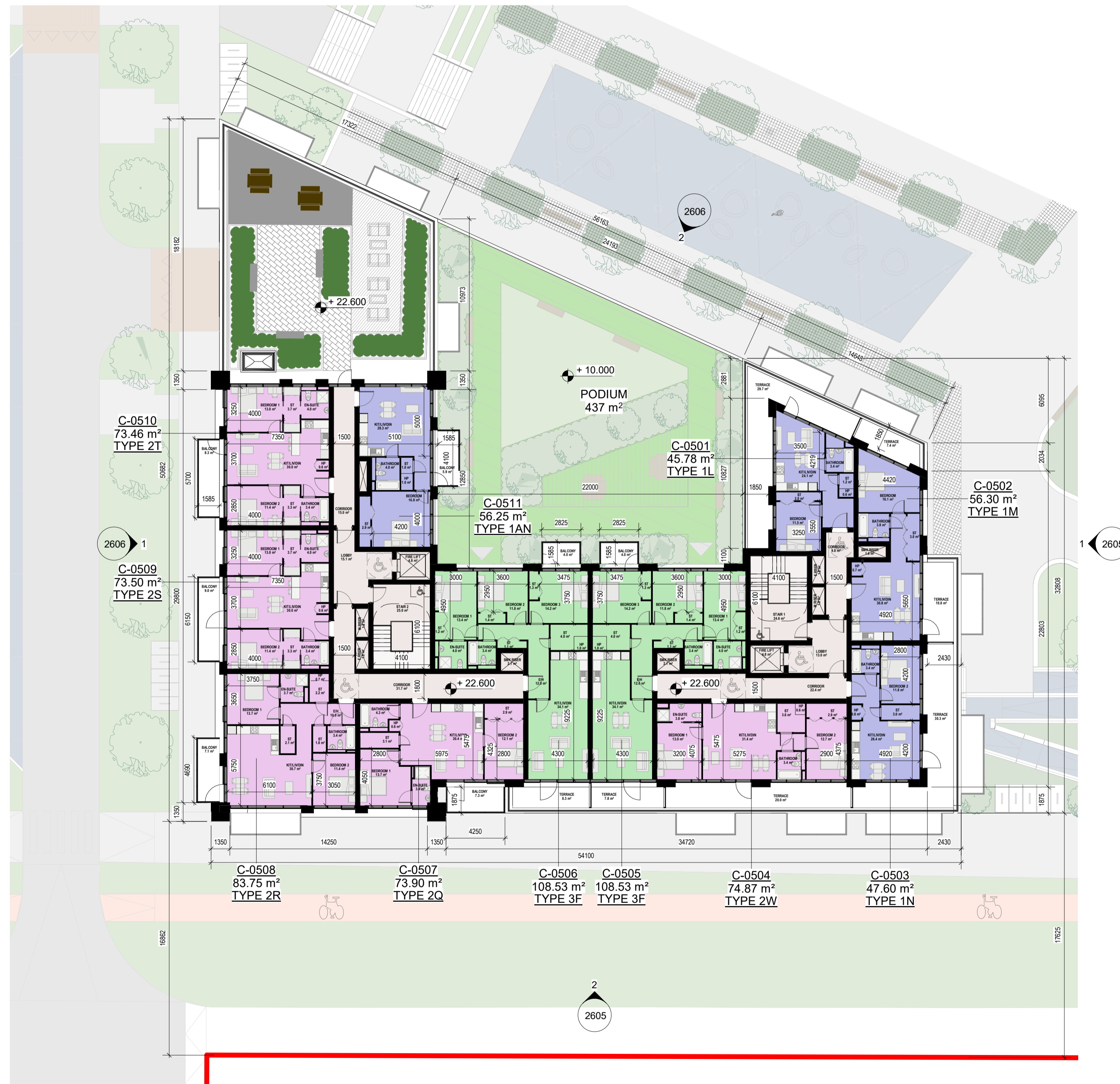
1 PLAN - BLOCK C - LEVEL 05 1 : 200

Please consider the environment before printing this sheet